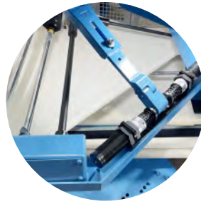
Roller Speed Adjustment Device