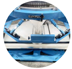
Open Width Fabric Take Down System