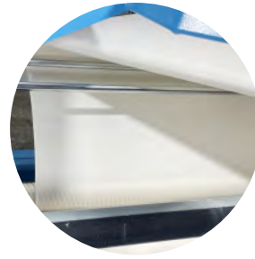
Spiral Roller in Taking-Down System